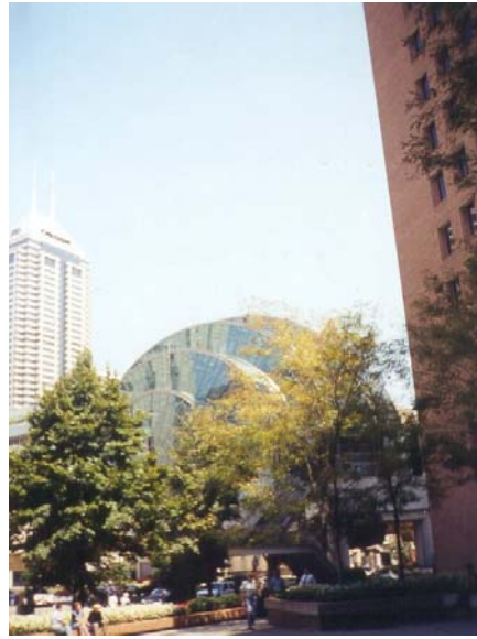
Downtown Indianapolis, IN. 2000