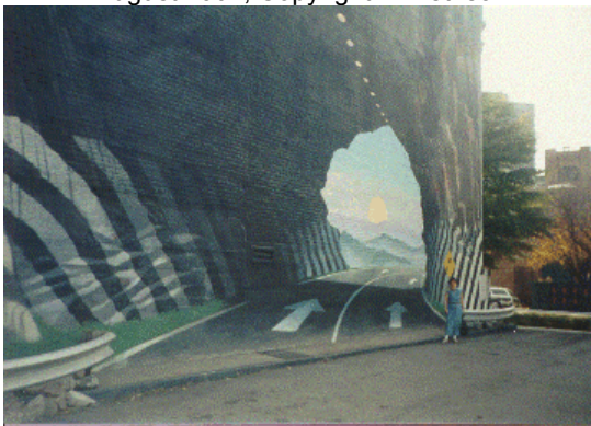
The famous "Tunnel Vision" in Columbia, SC was painted on one of the large buildings in the downtown Columbia, SC in 1975. Even the "real life" version of this painting is as realistic as it appears in the picture. August 2001