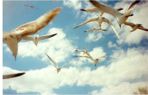
These seagulls fly in Charleston, South Carolina, trying to get the attention of the tourists and receive few pieces of bread. The picture featured also in several contests. 2000, Copyright A. Petrisor