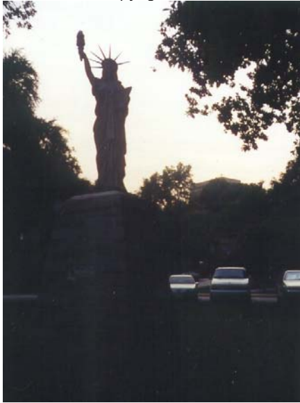
This small copy of the Statue of Liberty can be found in the downtown of Columbia, SC. 2000