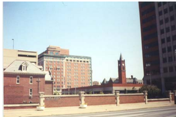
Saint John Catholic Church in Indianapolis, IN. 2000