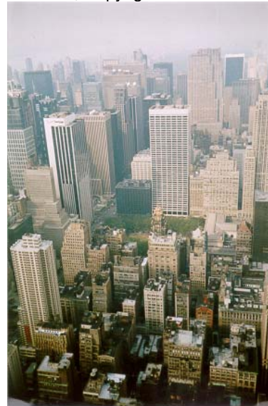
Manhattan, New York, NY, as seen from the 86th floor of Empire State Building. August 2002