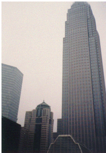
Downtown Charlotte, NC. Charlotte is one of the large, industrial cities in the Southern area. August 2001