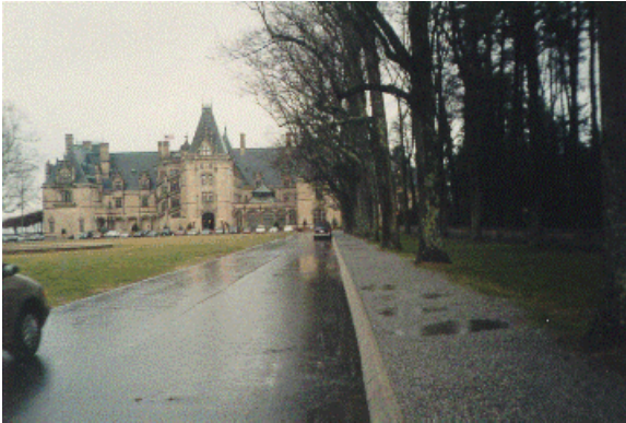
The Biltmore Estate in Asheville, NC, built by the Vanderbilt family in 1895, is the largest private residence in the US. A virtual tour can be taken at http://www.biltmore.com/. August 2001