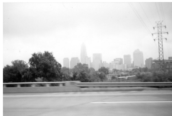
Downtown Raleigh, NC. 2000