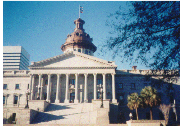
Every American State has a State House. The State House in Columbia, SC, also known as the Capitol Building, hosts the office of the Governor, the Parliament, and the Senate of the state.