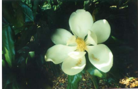
This is the picture of a magnolia flower, taken in Columbia, South Carolina. This picture participated in several contests and was published in several publications as well as on the WEB, at: http://www.thephotosite.com/display.asp?ID=167071.