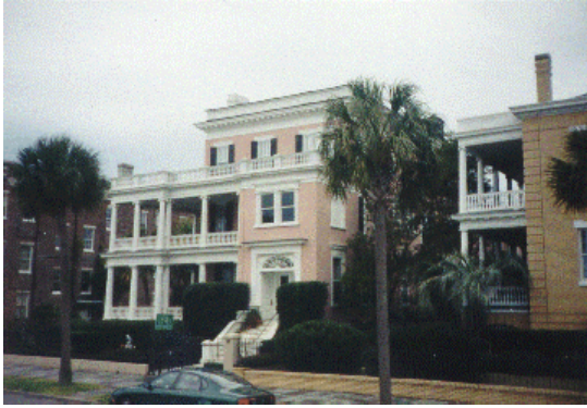
Charleston, SC is one of the oldest and most beautiful American Cities. Americans and Europeans, as well as Asians and others, love Charleston at the very first sight. The house featuring in the famous Gone with the Wind, by Margaret Mitchell, is situated at 2 Meeting Street in Charleston. This picture surprises some typical house for the city. August 2001