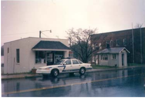
This is the smallest police station in the South, if not in the whole US. The old and smallest police station is the kiosk in the right side of the picture. The new police station is the one in the left, in front of which you may see a police car. The picture is taken in Ridgeway, South Carolina.