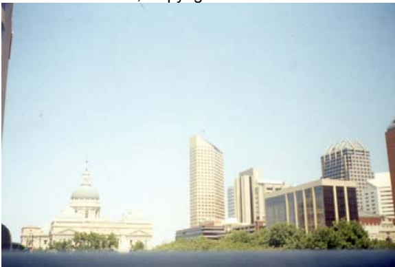
Indiana State House in the downtown area of Indianapolis, IN. 2000