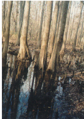
Congaree Swamps National Monument, South Carolina. These wetlands are the habitat for various fish, birds, and animals. August 2001