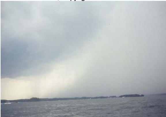
A storm was coming over Lake Murray in South Carolina. The picture, taken from a boat, surprises the