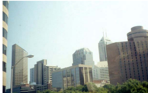
Downtown Indianapolis, IN. 2000