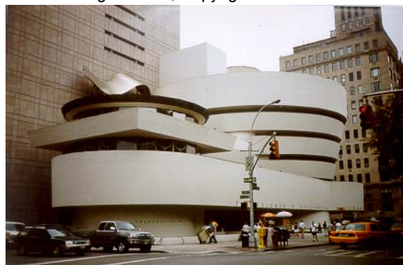
Solomon Guggenheim Museum- New York, NY August 2002