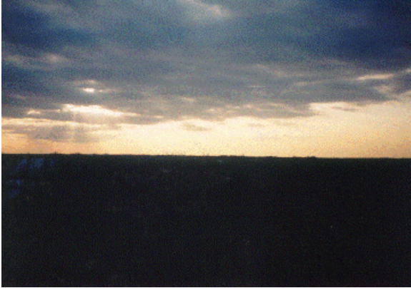
Atlanta, GA, as seen from the Stone Mountain in the sunset. August 2001