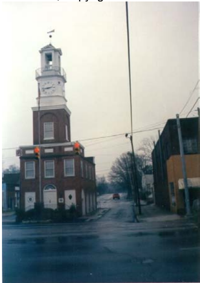
The oldest continuously operating town clock from the United States can be found in Winnsboro, South Carolina. 2000