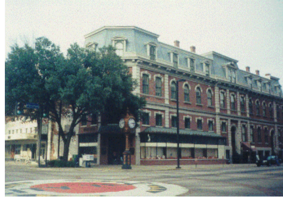
The Sylvan Center in Columbia, SC, a luxury jewel store, is a good example for the old architecture in the South.