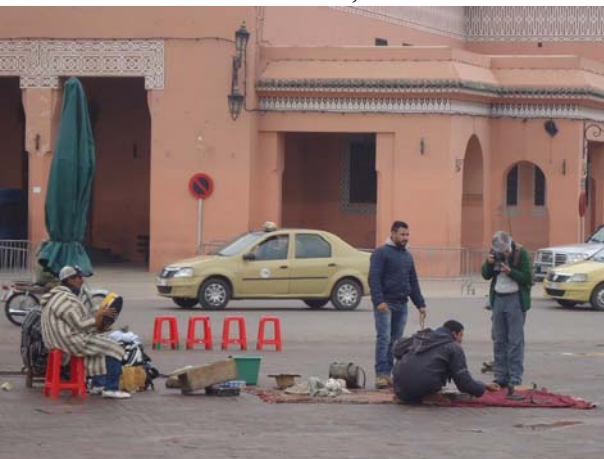
Djemma el Fna Square, Marrakech