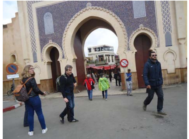
Blue Gate in Fes