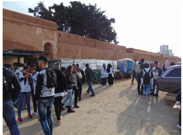
Rabat – entering the medina