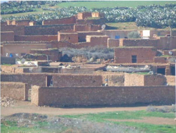
Rural settlement on the way between Marrakech and Rabat