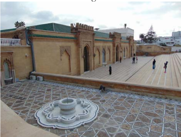
King Hassan II monument in Rabat