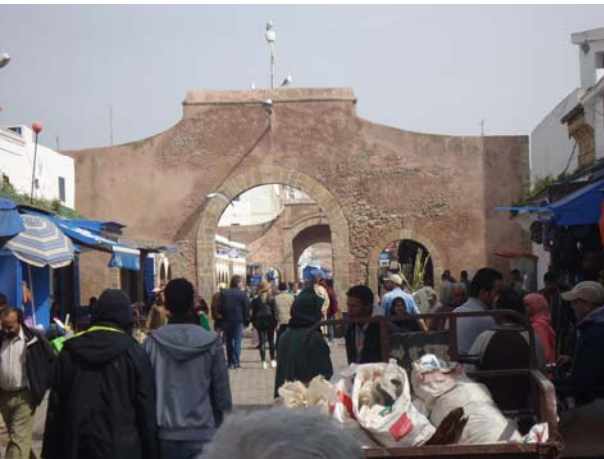
A walk through Essaouira