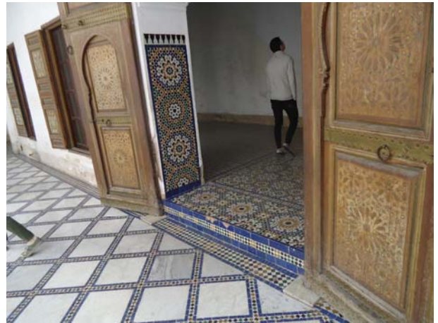
Bahia Palace, Marrakech