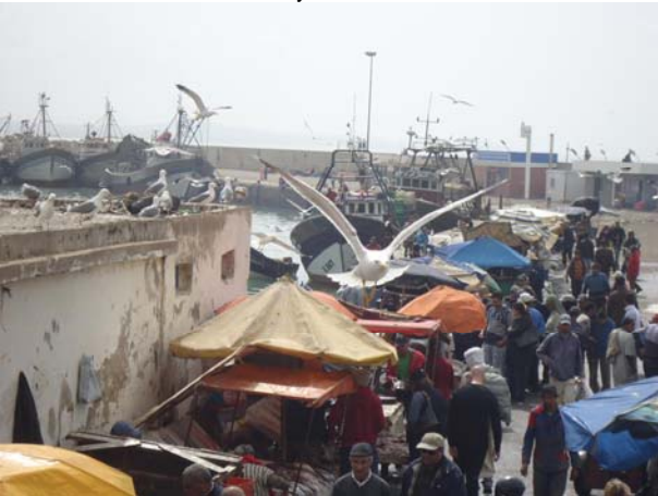
Essaouira – the fish market