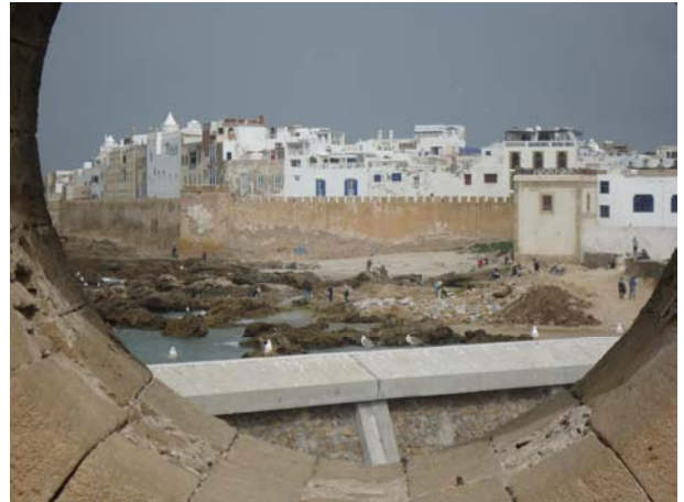
Essaouira – the medina