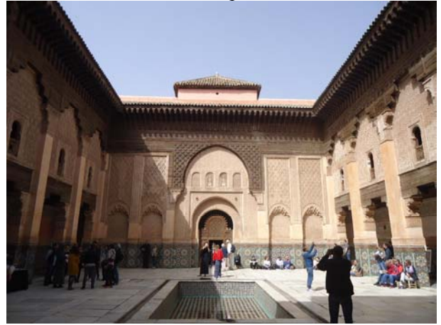
The Ben Youssef Madrasa in Marrakech