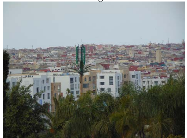
Rabat seen from King Hassan II monument