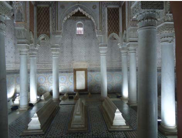
The Saladin Tombs, Marrakech