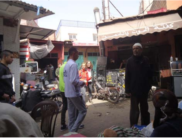
Places to eat in the souks of Marrakech