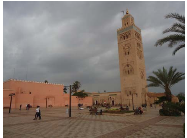
Koutoubia Mosque, Marrakech