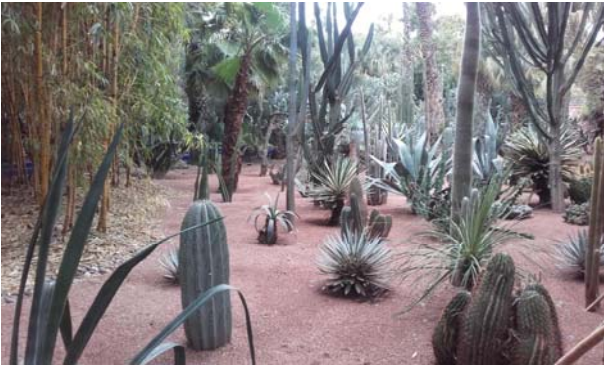
Majorelle Garden, Marrakech